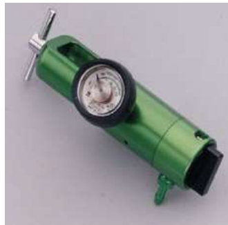
Yoke Body Flowmeter with Hose Barb outlet