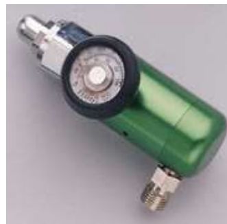
CGA Nut & Nipple Cap with Check Valve