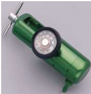
Yoke Body Cap with Hose Barb outlet