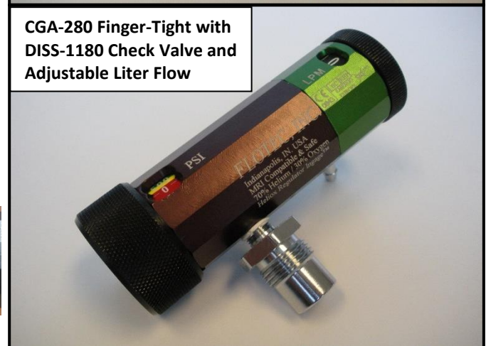
CGA-280 Finger-Tight with DISS-1180 Check Valve and Adjustable Liter Flow